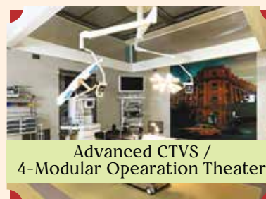
Advanced CTVS / 4-Modular Operation Theater