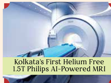
Kolkata's First Helium Free 1.5T Philips AI-Powered MRI