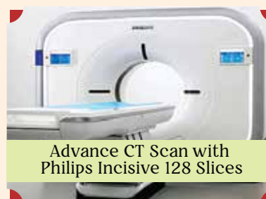
Advance CT Scan with Philips Incisive 128 Slices